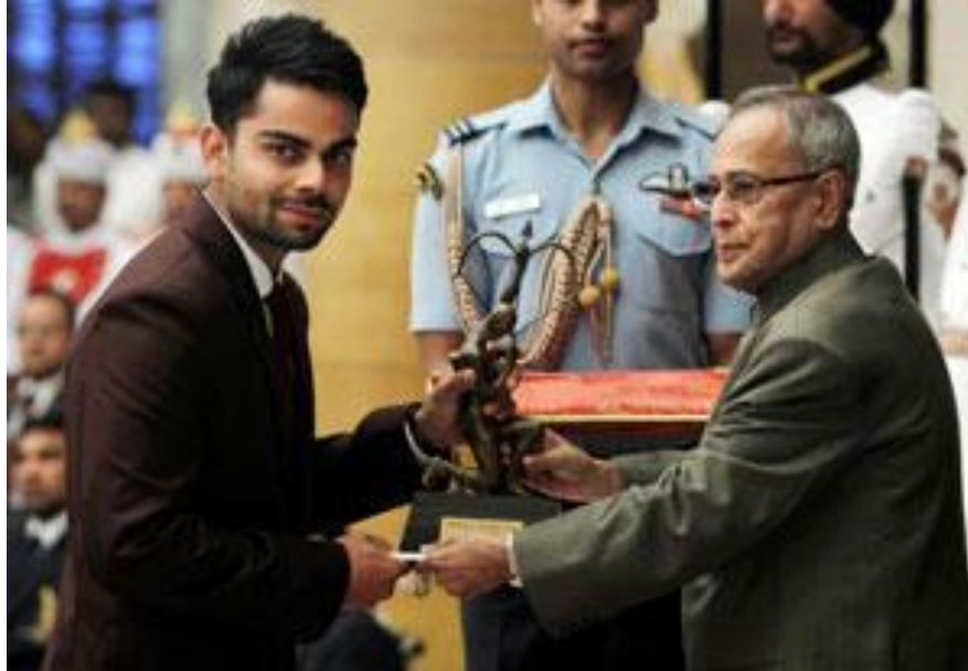
Being awarded by the President of India