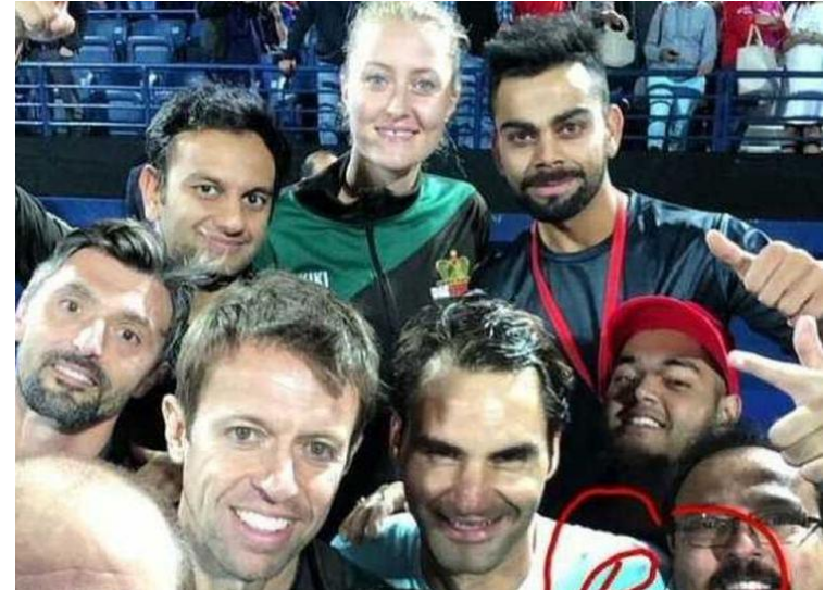
Co-Owner, UAE Royals, Indian Premier Tennis League