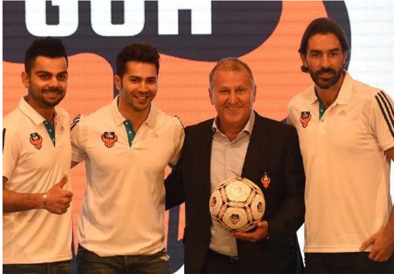
Co-Owner, FC GOA, Indian Super League, Soccer

To effectively promote and develop sports from the grass root levels